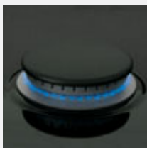
Dual-Stacked Sealed Burner

Red control knobs with platinum bezels are shipped with the rangetop, as well as porcelain-coated, cast iron, continuous top grates. Optional black knobs, bezels and grates are available as sales accessories.